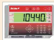
Programmable weighing computer as an option.

Trioliet reserves the right to make changes in design and specifications, or to add new features without obligation on implements before or after such changes are made.