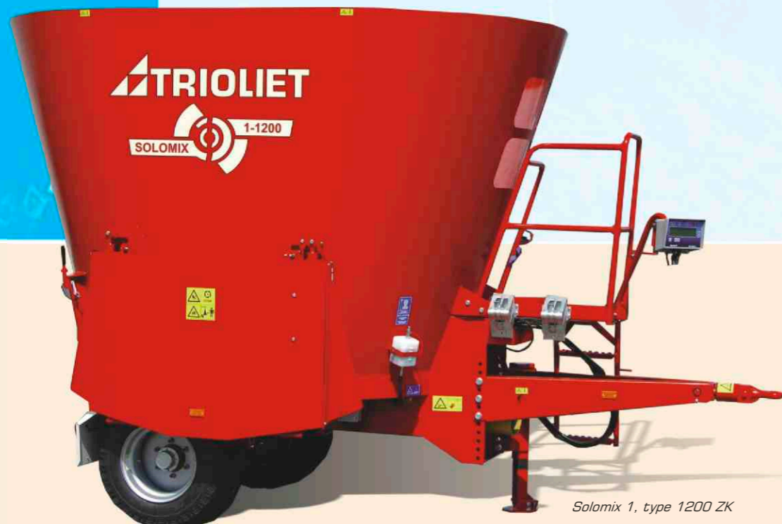
Solomix 1, type 1200 ZK